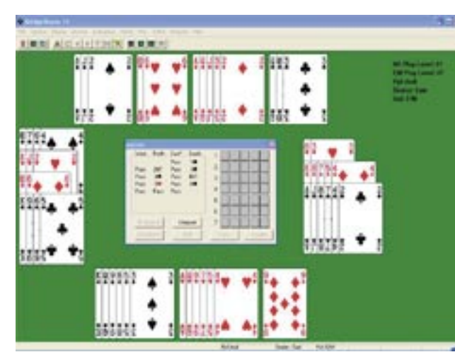
Bridge Baron gets to the top contract of 6♠ matching Bocchi-Duboin's result in the last session of the Bermuda Bowl Final (Meckstroth-Rodwell stopped in 4♠). Unfortunately it also matched the Italian declarer in the final score: 6♠-1.

writing about myself!) and there is an ample choice of tournaments, taken from recent US National championships, which the player can enter and where his score is matched against the original field. The unique feature which sets Bridge Baron apart from the rest is the attention given to learning tools for players wishing to understand and practice conventions: appropriate deals will be selected