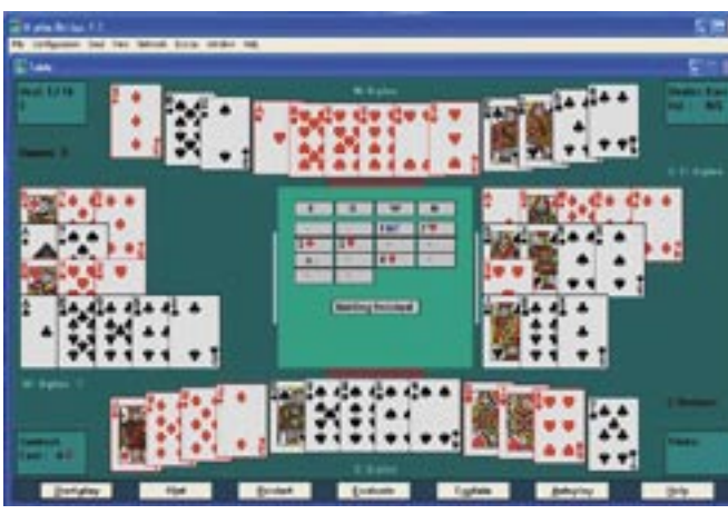
The Q-Plus West understandably upgrades its hand to a 1NT opening and both sides have an exciting auction to 4\bullet . In Israel-France, the Israeli pair played in 3NT-3, while the French were in 4\blacktriangledown -1X in N/S.

the strange order of East-South-West-North as opposed to the traditional West-North-South-East. The excellent manual and its versatility make Q-Plus a good option to choose, especially if the company's policy of always